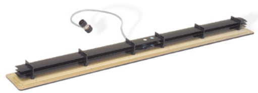
AOH comfort V 200 W